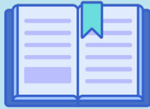
Table of Contents (ToC)

The ToC will help situate you and gives you perspective on what you're reading.